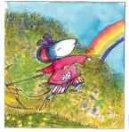
Character names and likenesses are trademarks of their respective owners.